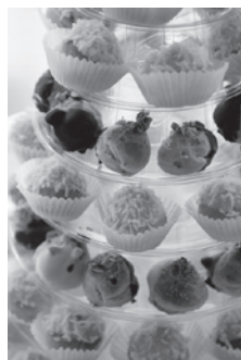
Choo-cket's cream puffs