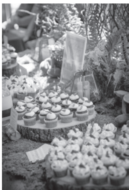
Lelé Patisserie cupcakes